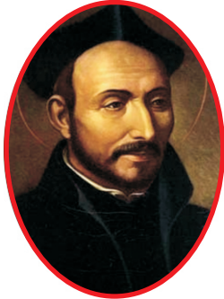
St. Ignatius of Loyola

A Recognised Minority Educational Institution( Reg. No. F-1261/12 )