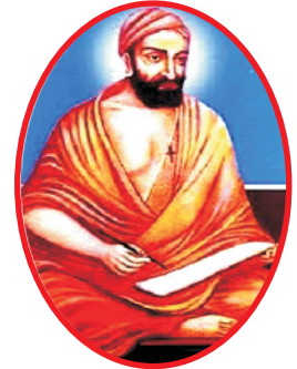
Father Roberto De Nobili