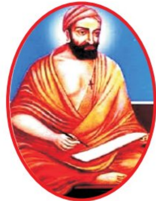
Father Roberto De Nobili