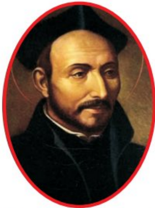
St. Ignatius of Loyola

A Recognised Minority Educational Institution( Reg. No. F-1246/12 )